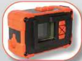
Rugged IP54 design for harsh and demanding environments