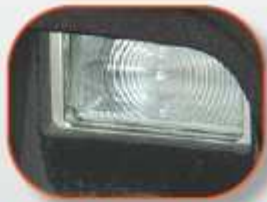
Onboard strobe flash for low light image capture