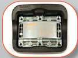
Removable battery pack interchangeable with other CorDEX Instruments®

ToughPIX 2301XP is supplied complete as standard with: